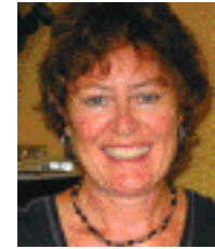
By Anne Marie Jackson

The 18 families in the Movement have formed several groups, each taking responsibility for different aspects of production—care and saving of seeds, organic vegetable gardening, creating biodegradable cleaning