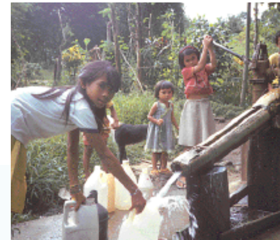
Collecting water for the family. Philippines.

From “Water, An Essential for Life”, a statement issued by the Pontifical Council for Justice and Peace, March 2003. Pope John Paul II also expressed grave concern for protecting water from contamination, improper use, and from exploitation for profit in his message on World Food Day, October 2002.